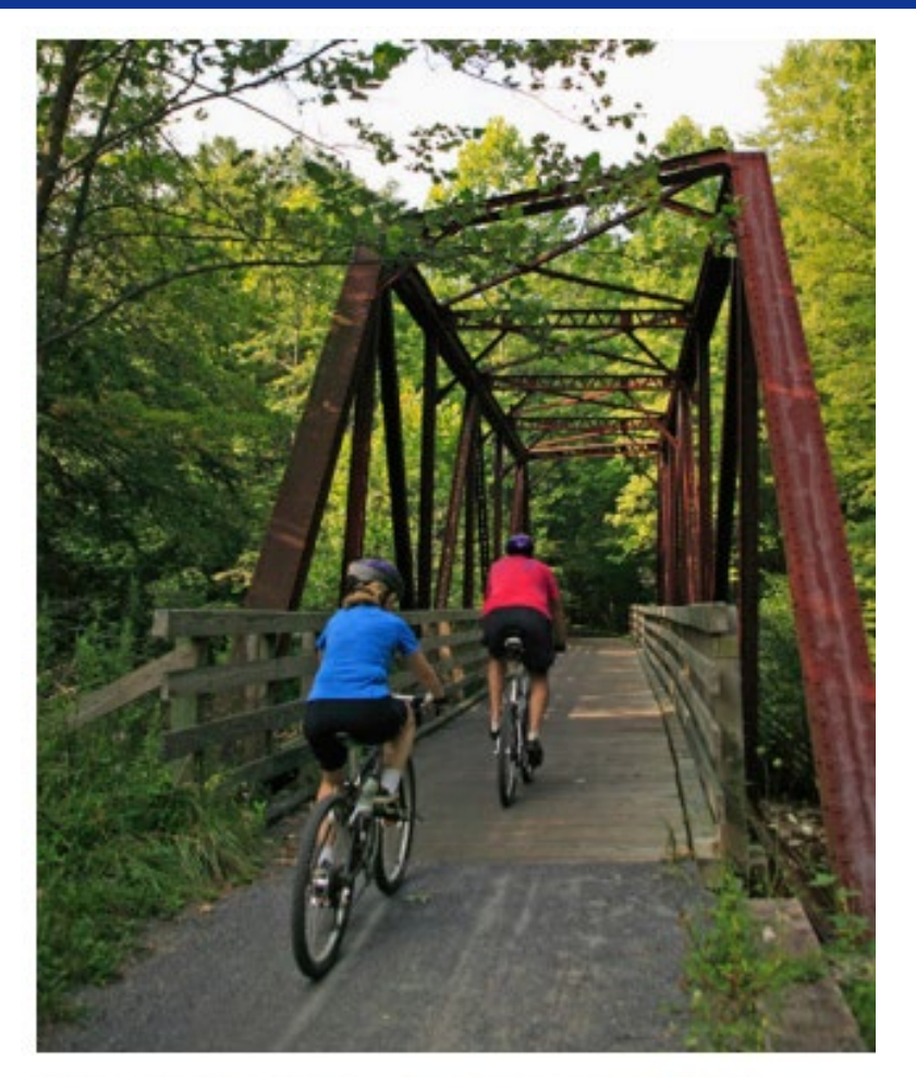
The Virginia Creeper Trail, Southwest Virginia