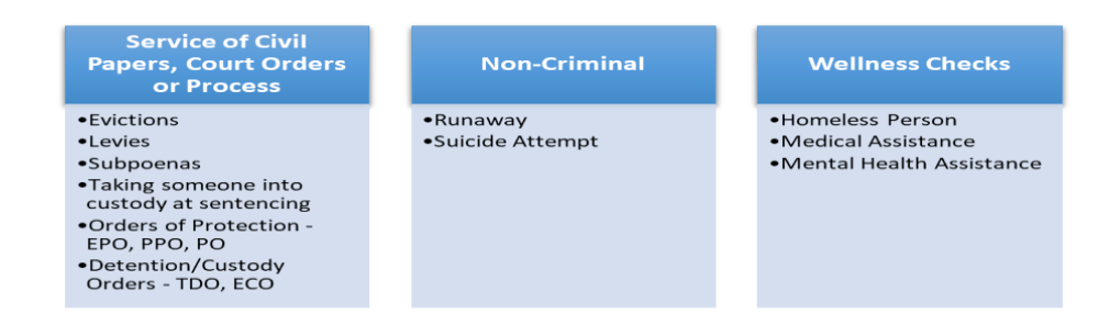
Note: These are merely examples and they do not represent an all-inclusive list. Some situations may have different elements. Therefore, each situation will need to be evaluated to determine if it meets the requirements of the data collection.

The following instances will most likely not require data collection, <u>unless they meet the</u> <u>elements of the CPA listed above</u>: