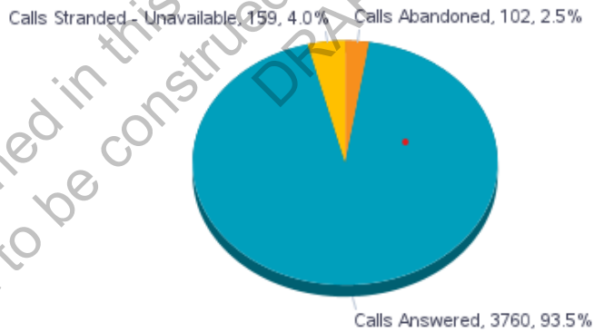
Call Center Activity

The PSSWPG Board's call center has received a total of 4,021 phone calls between January 1, 2024, to May 23, 2024. The chart below illustrates the calls received in more detail: