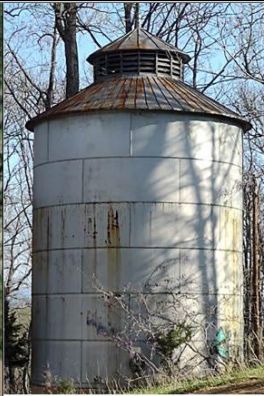
Old versus newer water storage tank.