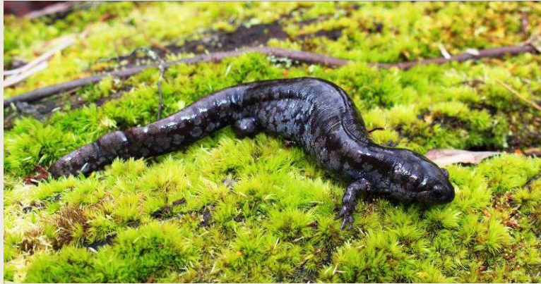
Mabee's Salamander