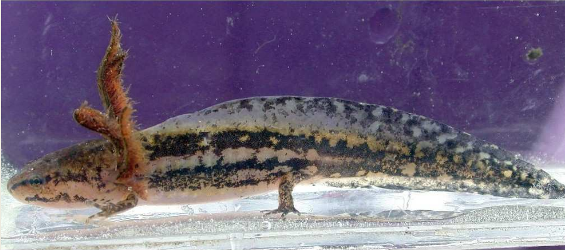
Mabee's Salamander, larval form Ambystoma mabeei