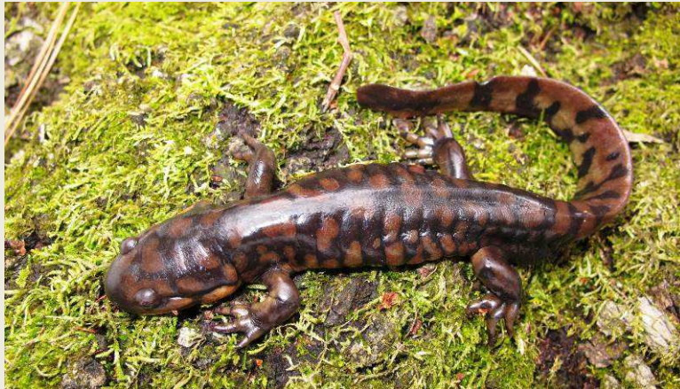
Tiger Salamander