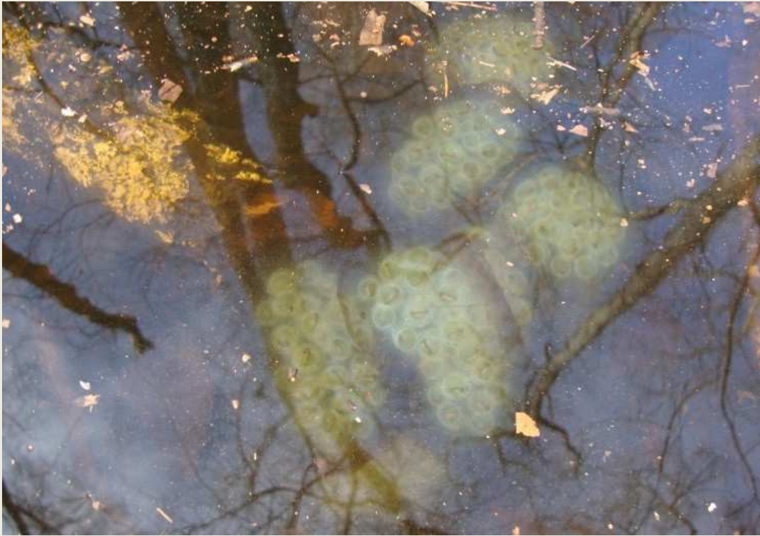
E) Spotted Salamander egg masses